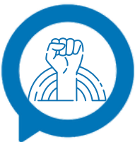
Respect for Rights

We work to a strong moral code rooted in the ideals of social justice. We challenge the oppression and discrimination faced by children and young people in care and seek to reduce the stigma they face in their daily lives.